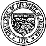
Janice K. Brewer GOVERNOR