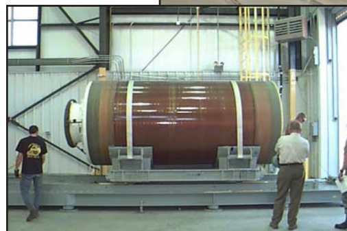
Photos show the Camp Navajo Industrial Operation personnel loading a stage of the Minuteman Missile into storage.