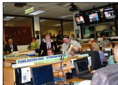
The SEOC activated during Operation Good Neighbor.