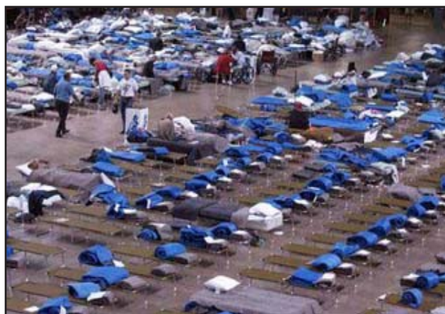
Arizona's Operation Good Neighbor

Operation Good Neighbor (26003/EM-3241). On September 3, 2005 the Governor declared a state of emergency in support of the Hurricane Katrina, Arizona's Operation Good Neighbor. The Governor was requested by the Federal Emergency Management Agency (FEMA) to assist with the national state of emergency due to the catastrophic consequences of Hurricane Katrina. (SEOC activated)