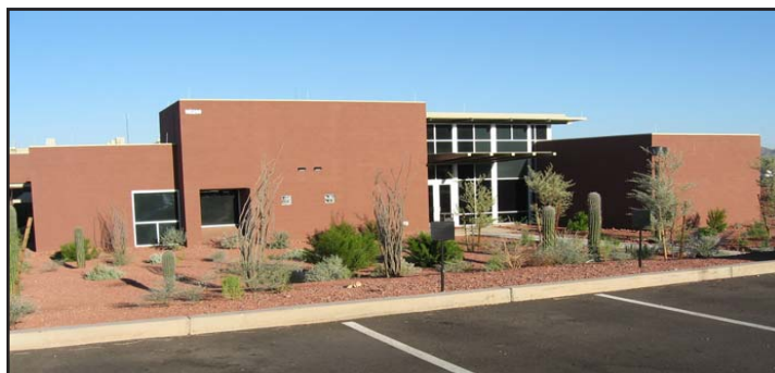
The new 91st CST (Weapons of Mass Destruction) building was completed during the tail end of FY2005.