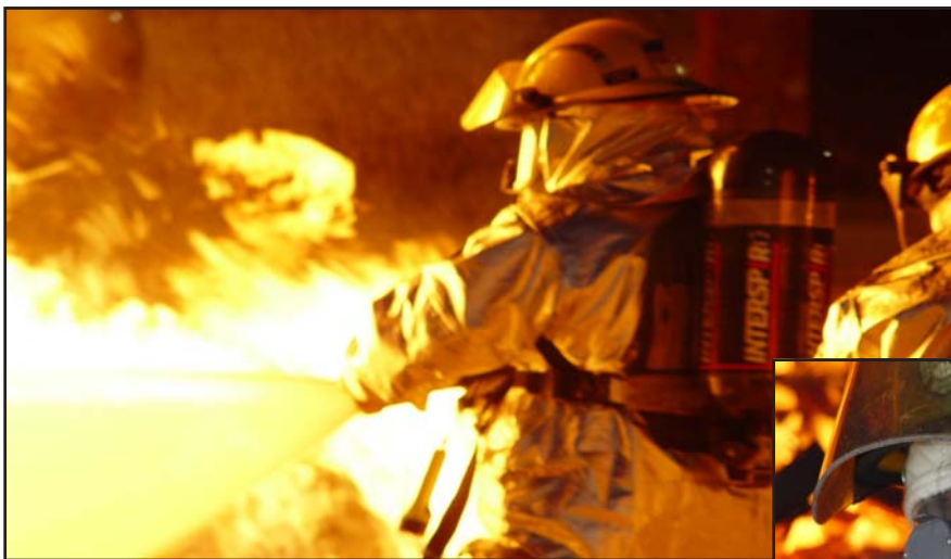
The 162nd Fire Fighters in training during a 2006 Summer exercise.