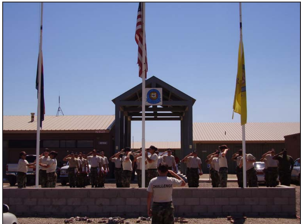
All photographs are courtesy of Project ChalleNGe and depict the Classes 25 and 26 during 2006.