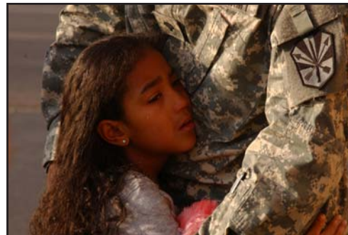
258th Rear Area Operations Center (RAOC) departing for their tour in Iraq in July 2006.

During 2006 the Arizona Army National Guard deployed or mobilized 1,029 Soldiers – a number