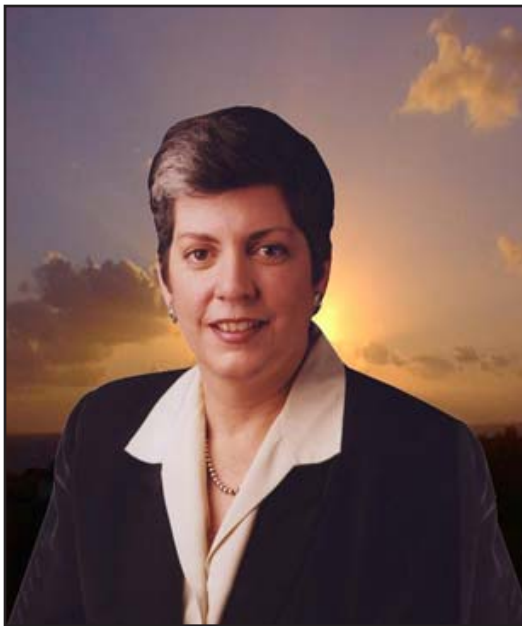
Governor Janet Napolitano